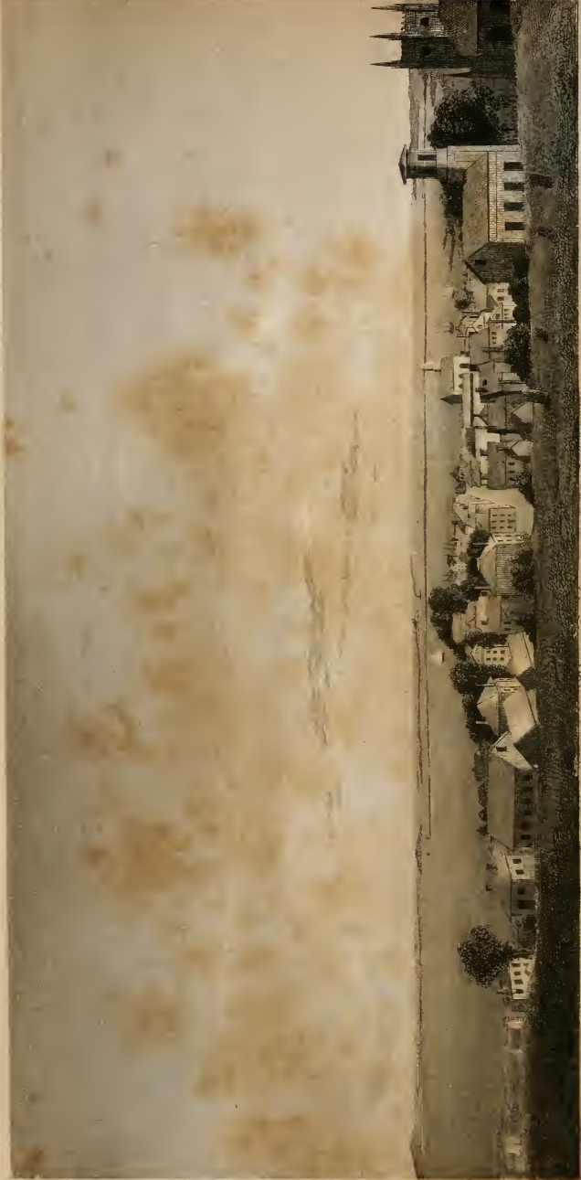
Plymouth from the Burying Hill